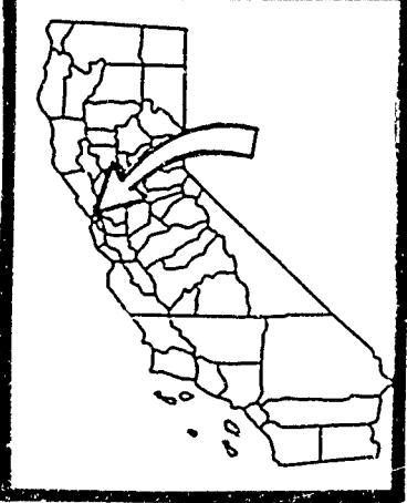
EXHIBIT "A" APPLICATION FOR DREDGING PERMIT W 23495 LESLIE SALT INC. (APPLICANT)