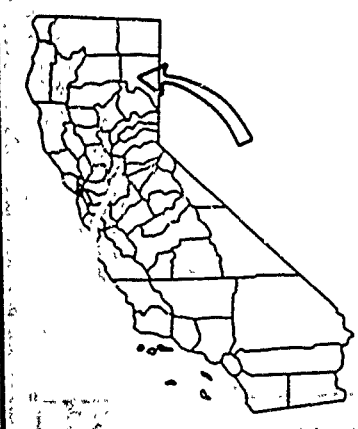
EXHIBIT "B" W 23560