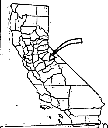
EXHIBIT "B" W 23516