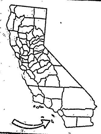
EXHIBIT "B" PRC 6439.1

Santa Barbara Channel Islands National Monument SANTA BARBARA COUNTY