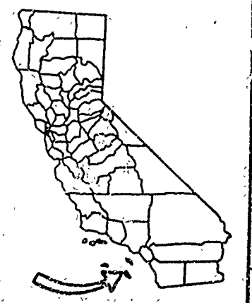
EXHIBIT "B" W22957.10