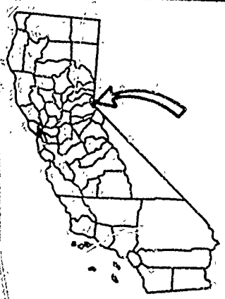
EXHIBIT "B" W. 23406