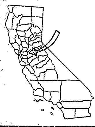
EXHIBIT "B" W 21248