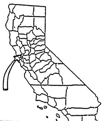
EXHIBIT "B" W 23341