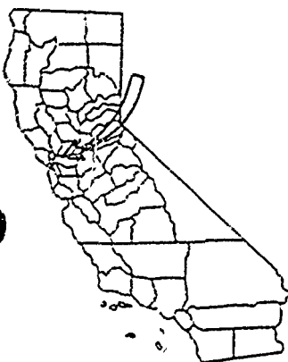
EXHIBIT "B" W 2400.151

CITY OF ANTIOCH U.S. STEEL ANNEXATION 84-2