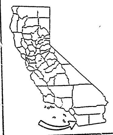
EXHIBIT "A" W 23349