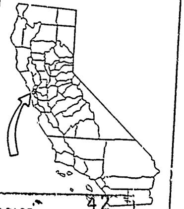
EXHIBIT "B" W 23216