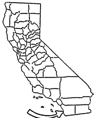
EXHIBIT "B" W 23254