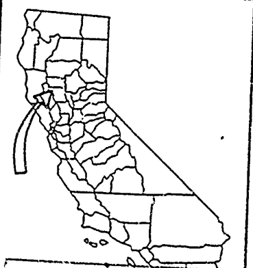
EXHIBIT "A" W 503.1153