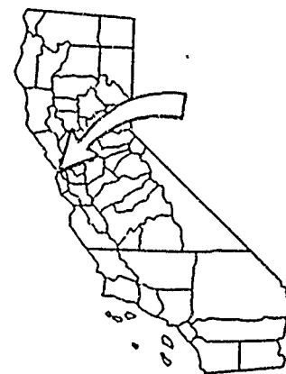
EXHIBIT "A" APPLICATION FOR DREDGING PERMIT AMERICAN BRIDGE (APPLICANT) W 23195 HUNTERS POINT FABRICATION YARD