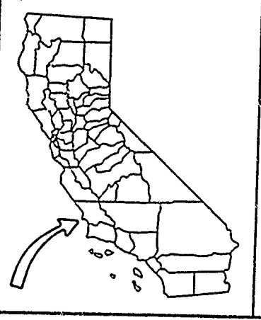
EXHIBIT "B" WP 2478