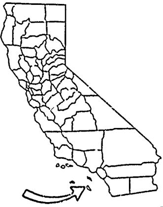
EXHIBIT "B" W 22957.2