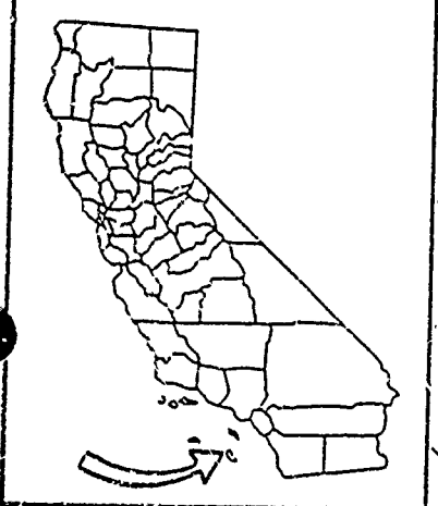
EXHIBIT "B" W22957.10

Santa Barbara Island CHANNEL ISLANDS NATIONAL MONUMENT SANTA BARBARA COUNTY