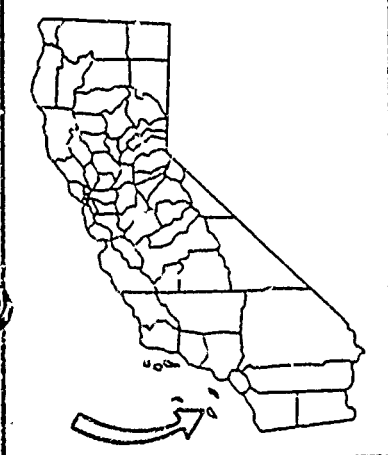
EXHIBIT "B" W 22957.6

Santa Barbara Channel Santa Barbara Channel National Monument