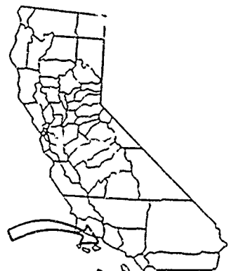
EXHIBIT "B" W 240C.148