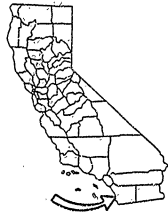
EXHIBIT "B" W 23077