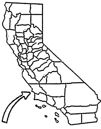
EXHIBIT "A" W 503,823