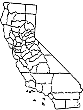
EXHIBIT "A" WP 5059

ENGINEER'S STATEMENT I, the undersigned, being duly qualified, do hereby certify that the above is a true and correct copy of the original as shown to me by the applicant.