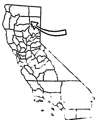
EXHIBIT "A" W 503.1064