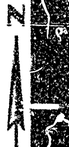
EXHIBIT "B" PRC 5920