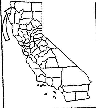
EXHIBIT "A" WP 5284