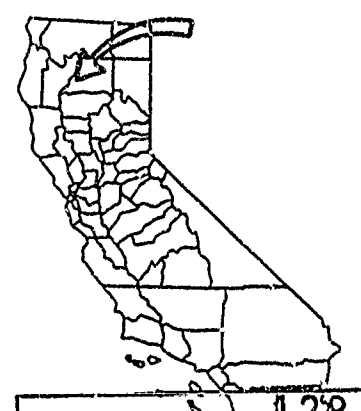
EXHIBIT "B" SH 3324