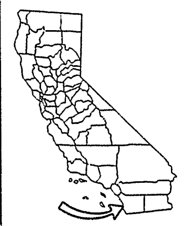
EXHIBIT "B" WP 5505