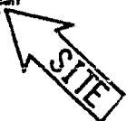
EXHIBIT "A" PRC 3545.1