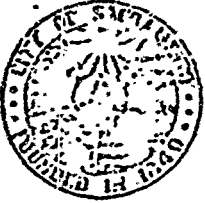
EXHIBIT "C" CITY OF SACRAMENTO