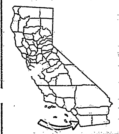
EXHIBIT "A" W 503,988