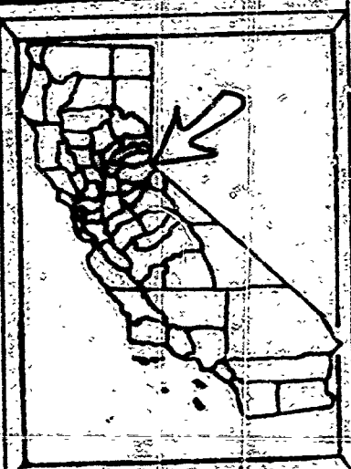
EXHIBIT PRC 5300