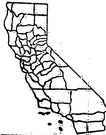
EXHIBIT A PRC 5447.1