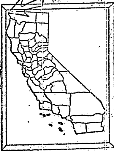
EXHIBIT "A" W 287.81