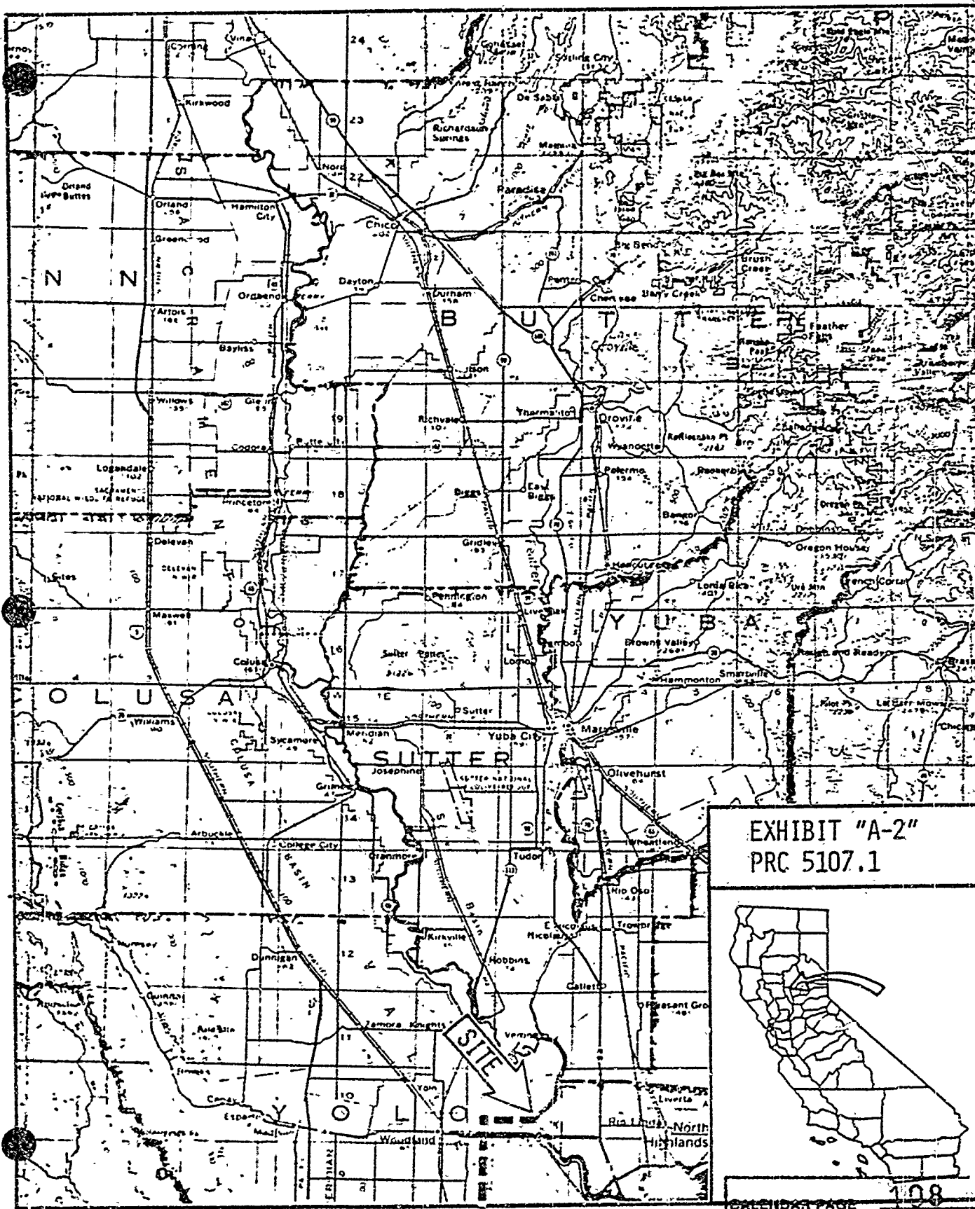
EXHIBIT "A-2" PRC 5107.1