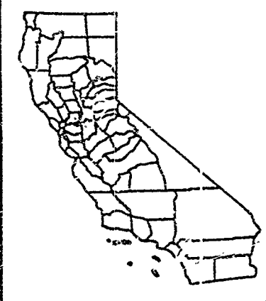
EXHIBIT "A" WP 5720