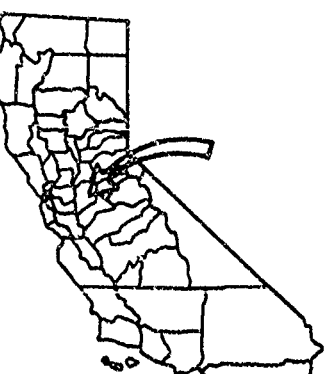
EXHIBIT "A" WP 2610