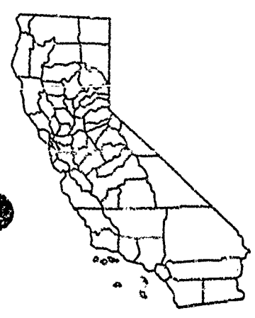
EXHIBIT "B" W 2400,125