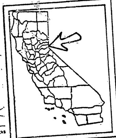
EXHIBIT 'B' W 21391