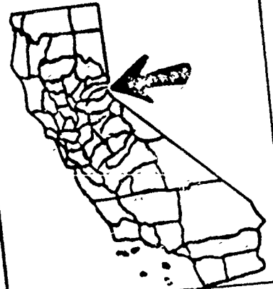
EXHIBIT "A" W 1124.313