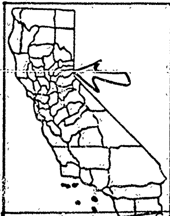
EXHIBIT " B " W 21663