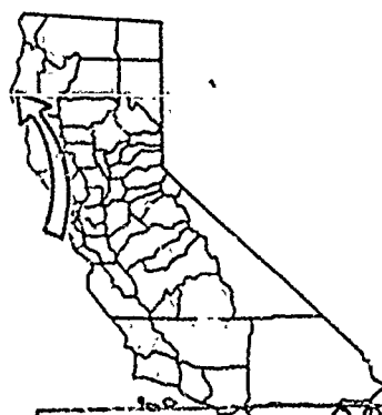
EXHIBIT "A" W503.719 / W503.722