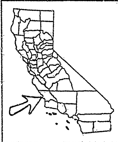
EXHIBIT "A" WP 3875