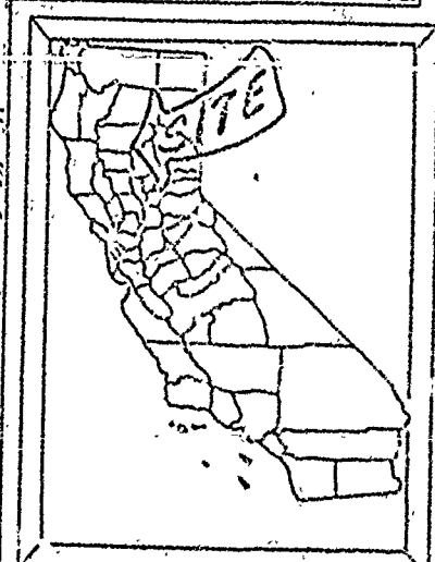
EXHIBIT "B" WP 4549