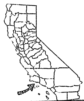
EXHIBIT "B" W 21902