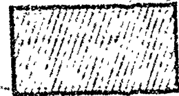
EXHIBIT "A" S & O Survey 913 - Yolo