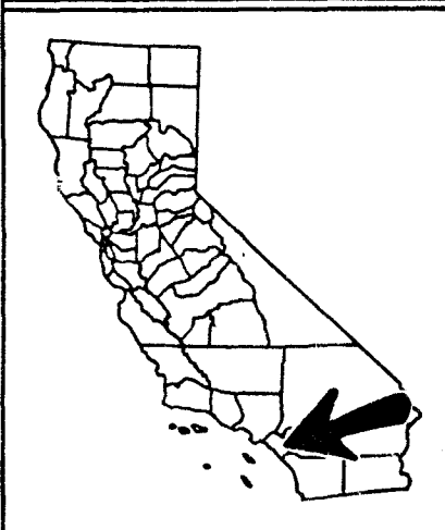
EXHIBIT "A" W 21886