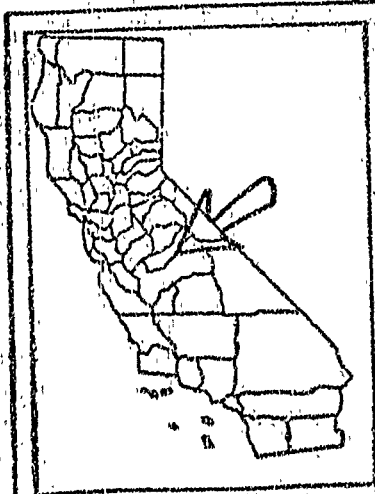
EXHIBIT 'B' W21274