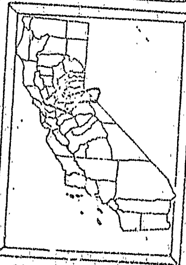
EXHIBIT "B" W 20504