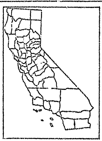
EXHIBIT B W8900