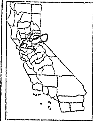
EXHIBIT 'B' W 21223